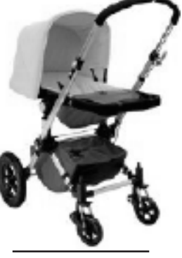
The Bugaboo Cameleon

If you want a good "push" and have some extra cash, the <u>Bugaboo Cameleon</u> is the top of the line. It's the Cadillac of strollers: dual independent shock absorbers on the front wheels, rubber tires in the back, endlessly configurable, the "Bug" is a great vehicle – but it's expensive (over 900 bucks) and doesn't fold easily. Bugaboo also makes Frog and Bee models that are smaller and slightly less expensive than the Cameleon.