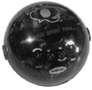
The 20 Questions ball with four buttons: Yes, No, Sometimes, and Unknown. Brilliant design.

The one caveat, especially if you're showing it off to kids, is to start with something easy: a lion, or a broom, or something similarly easy. Allow the ball a good first impression – nailing the first item – and then work up to more obscure items later. (If you're especially