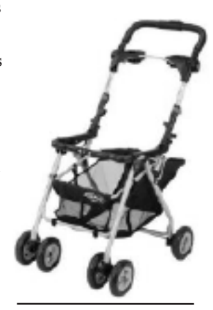
The Graco Snugrider "snap 'n' go."