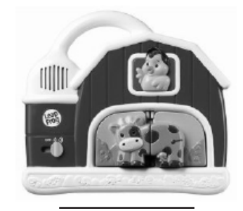
The LeapFrog Fridge Farm

outstanding (a quality I've found in most LeapFrog products I've tried), but the real brilliance of the product is contextual. The Fridge Farm fits nicely onto the front of the refrigerator, thereby giving the kid a fun distraction when they're in the kitchen. Parents will grasp the importance of this benefit: the child can occupied by a safe toy (rather than cabinets or sharp implements) that sits on a vertical surface, rather than in the middle of the floor. Our own playtester has been delighted by the FridgeFarm for several months now. Highly recommended.