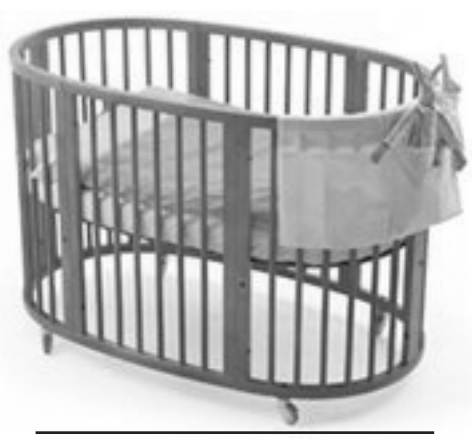
The Stokke Sleepi, already expanded once

Back to the snap 'n' go. Unfortunately, that Graco combo only lasts for the first few months, until the baby weighs twenty pounds or so. Soon enough it becomes time to shop for a "real" stroller.