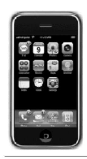
The Apple iPhone, Uncle Mark's phone and camera pick for 2009.

• It's the best cell phone available today. Even if you ONLY use it as a cell phone, the iPhone is worth buying, because its design is excellent in contrast to the embarrassingly bad, user-hostile interfaces that most cell phones have. The iPhone's voicemail is a joy (it looks like an e-mail inbox; no more phone-voice droning "you... have... one... message..."), "silent" mode is a switch that's easy to reach, contacts are easy to manage, etc.